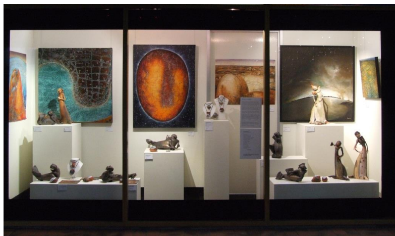
Example: Exhibition of works by Cernak and Catherine Macauley.