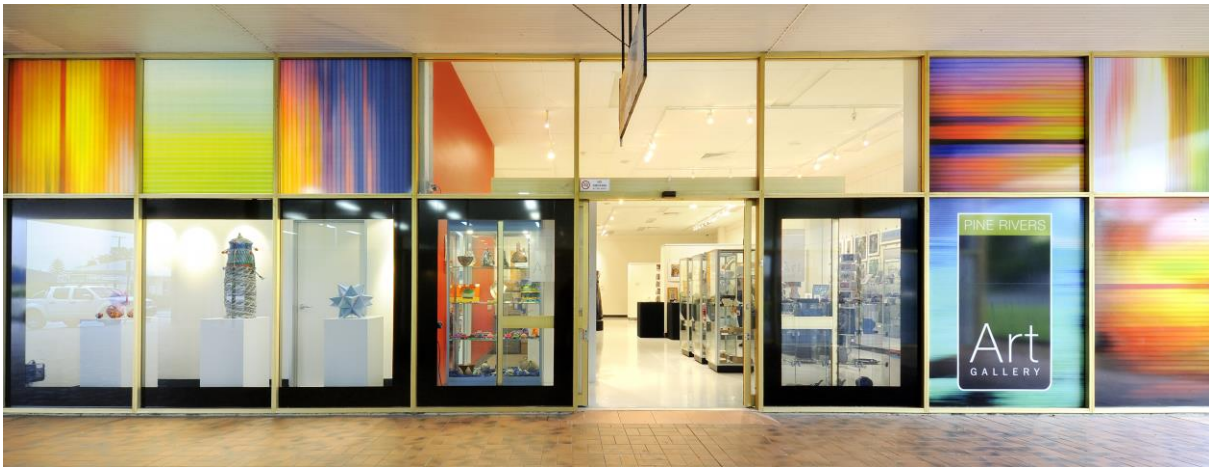
Gallery entry & window.

The gallery window is approximately 4 metres wide, 1.5 metres tall & 1 metre deep